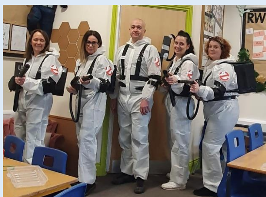
Staff from Tryfan Class on our Super Hero Theme Day!

Meetings of the full Governing Body take place termly and when possible are held face to face.